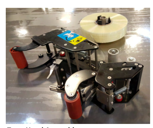
Tape Head Assembly