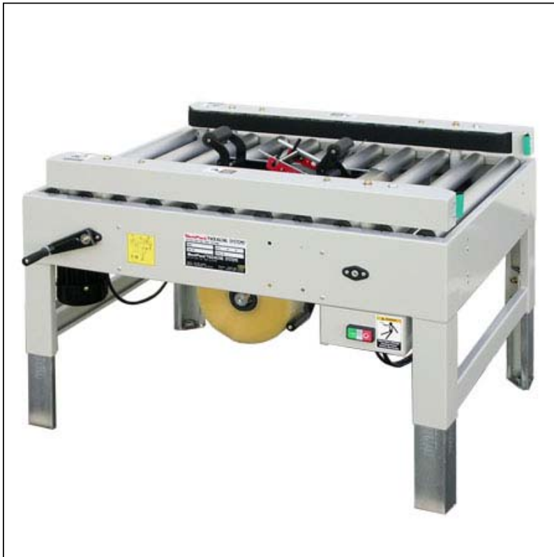
MSD22 Manual Side Drive