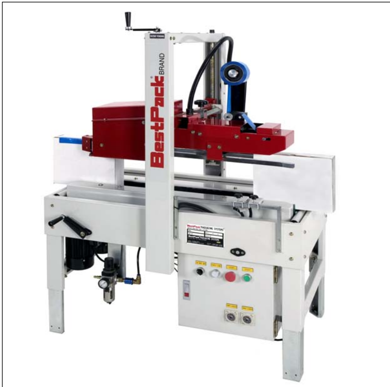
MS1E Manual Side Drive One Edge