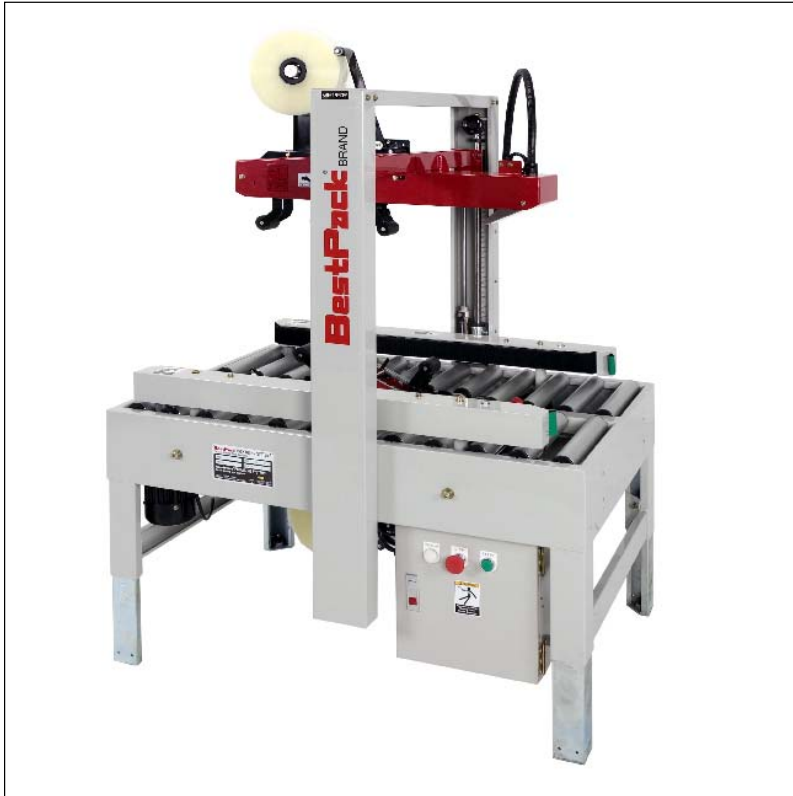
RS22 Random Side Drive