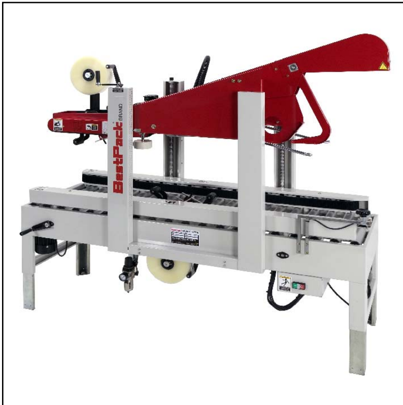
AQ Automatic Quad Drive